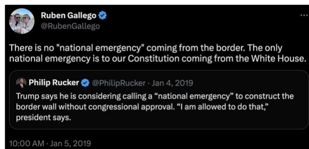
(Ruben Gallego, Twitter , 1/5/19)