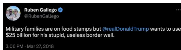
(Ruben Gallego, Twitter , 3/27/18)