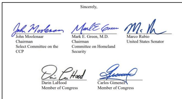
(Letter, Select Committee on the CCP , 6/5/24)